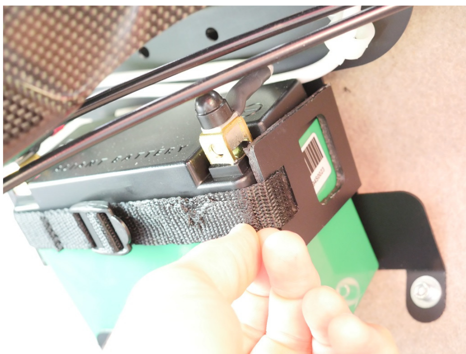
Figure 2: Fore battery installation – tearing away the strap's loose end