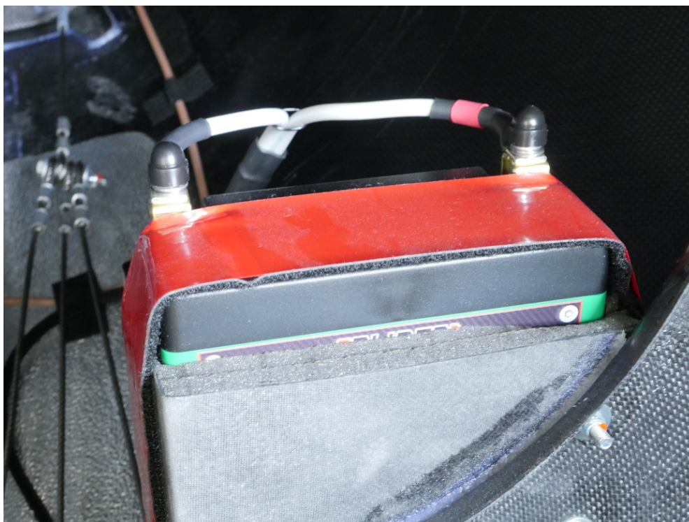
Figure 1: Aft battery installation