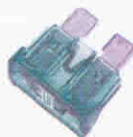
Example 30 Amp non-self re-settable fuse

In a rare-case, as a result of operating style and/or environmental conditions, it is possible that self-resettable fuses cause a reset even when the nominal Amp-rating is not reached. Therefore it is recommended to use classic (non-self re-settable) fuses in the main fuse-housing on the aircraft. When replacing fuses, make sure you keep their AMP rating the same. Only in case of the 25 A fuse, it is permissible to use a 30 A fuse as replacement